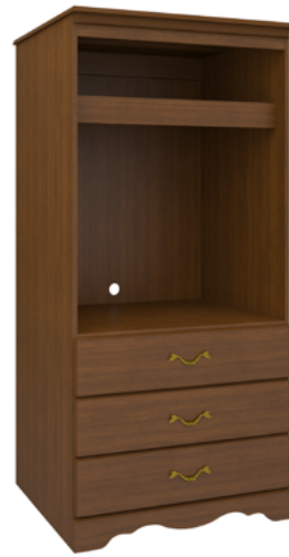
Model: CHAMTV30 35.5W 25.75D 72.25H

The Charlotte Collection is the perfect fit for any traditional senior living environment. Gently radiused corners and OG edging protects fragile skin, while the styling uplifts and restores the spirit. Raised cabinetry promises ease of cleaning below case goods.